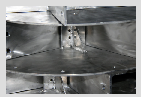
Extra heavy-duty fully welded aluminum back plate offers exceptional structural support for radome