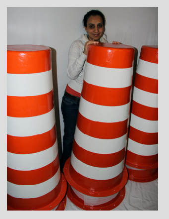
Radome sized for 7-element UHF yagi