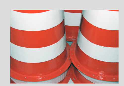
JAG signature FAA orange & white heavy-duty tapered fiberglass radome with smooth finish